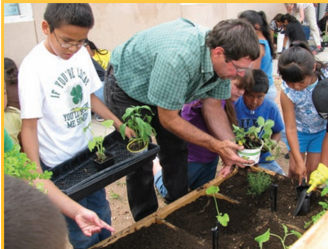
Summer Food Program

The overarching goal of the Plan was accomplished late last year: To move New Mexico from the worst in the nation in hunger (2007, USDA) to the 45th in hunger. Based on the USDA food insecurity data released in November 2009, New Mexico became 45th in food insecurity in the nation.