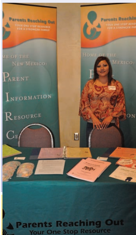
Parents Reaching Out Booth at Philanthropy Fair